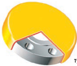
Type 1, Flexibel