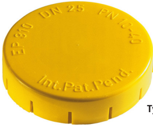
Type 2, Hard